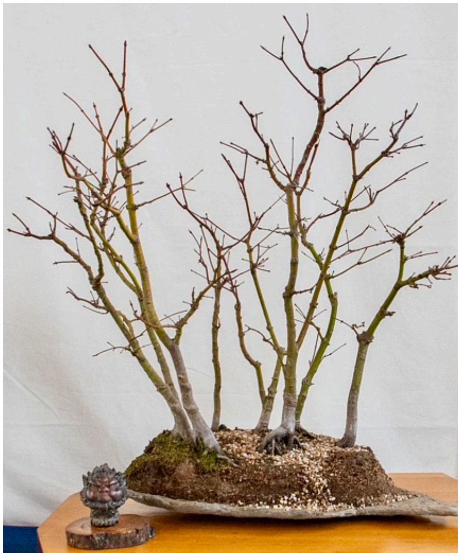
Left: Japanese Maple ( Acer palmatum ) forest by Charlotte Field.